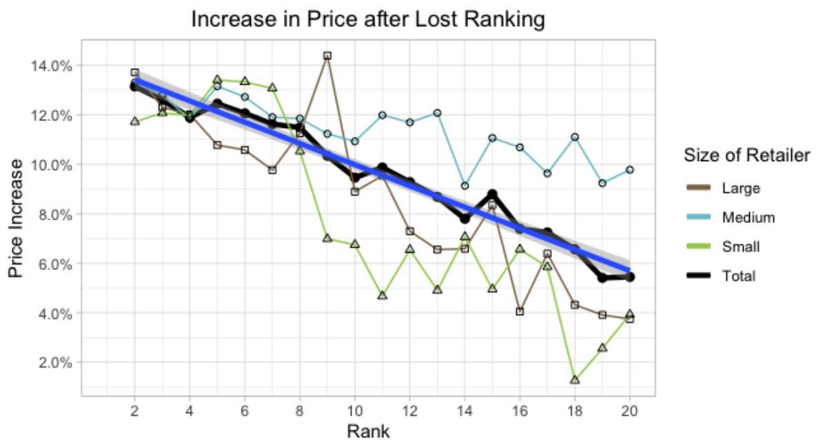
Figure 4: Increase in price as a consequence of lost ranking. Retailers have been separated by size. Dark blue line symbolizes the trend where the shadow area displays one standard deviation.

Even though Figure 2 only presented how price increases were comparably infrequent, we should examine how these price increases evolve for the rankings. With a limited variation in the average total price increase for the different positions, we observe a steep downward facing trendline with a minimal standard deviation, presented in Figure 4. Since hypothesis H3 only studies if there is a cost difference in retaining rank positions across Prisjakt’s rankings, a price increase following a decreasing ranking will not be addressed in the given hypothesis. Despite this, we can confidently argue for the occurrence of price increase depending on the ranking. Similar to the price decreases, we also identify how the most extensive degree of change occurs for the highest rankings, which after that is followed by a steeper reduction in price increases as we move down the rankings.